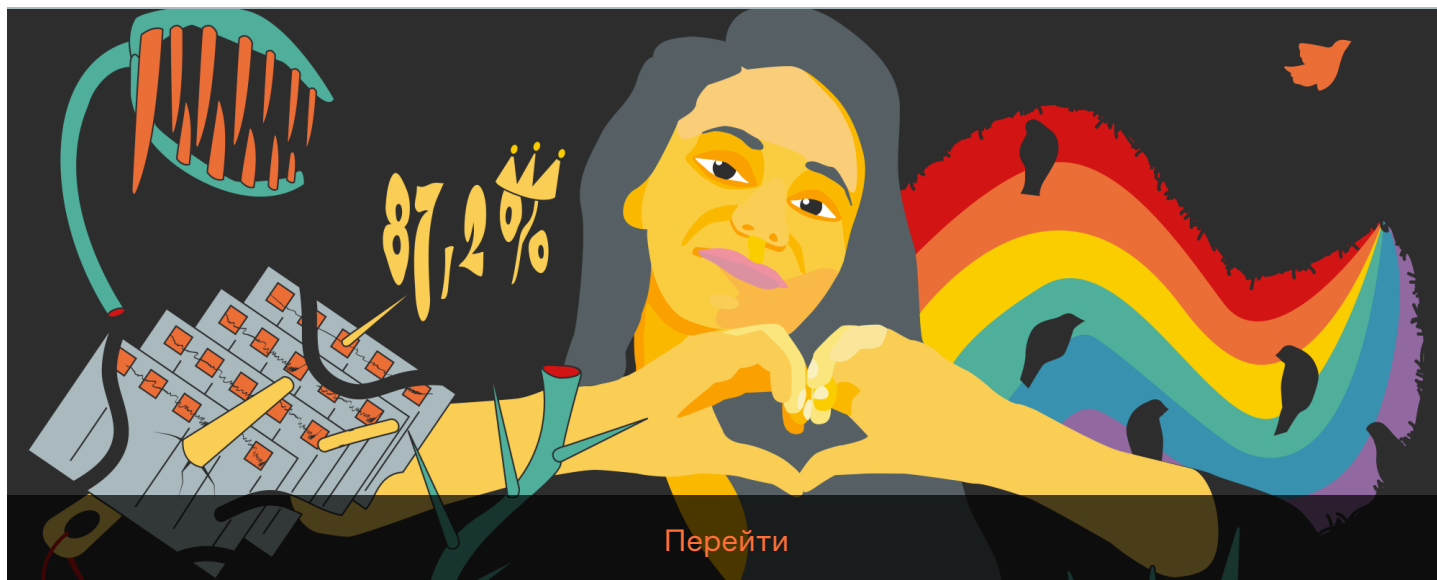
Illustration: Ilya Martynov for OVD-Info